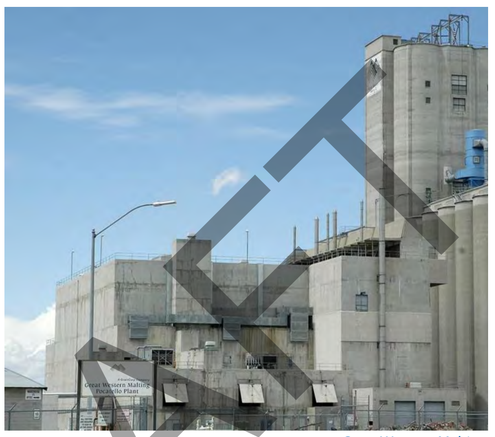
Great Western Malting