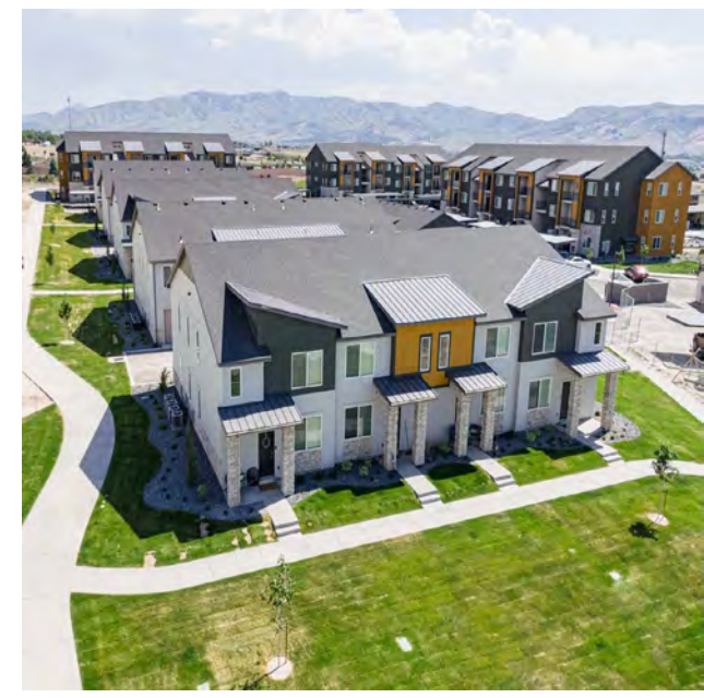
Kartchner Homes Northgate Apartment Development

The Kartchner Homes Northgate Apartment development and the North Campus of the Portneuf Health Trust were completed in 2023. Also, The Crossings Division 1 and 2 have continued to fill in, but still have a significant number of undeveloped lots. In the district, construction of the new Beard, St. Clair, & Gaffney Attorneys and the BBSI office building has begun and is anticipated to be completed in 2024. Additionally, there are a number of other projects in the planning phase including Broulim's Groceries, Westmark Credit Union, and Idaho Central Credit Union. There has also been progress in the development of Northgate District Division 2 with the extension of sewer and water infrastructure, as well as, District Lane and District Drive. Northgate District Division 2 consists of 14 commercial lots that are currently for sale.