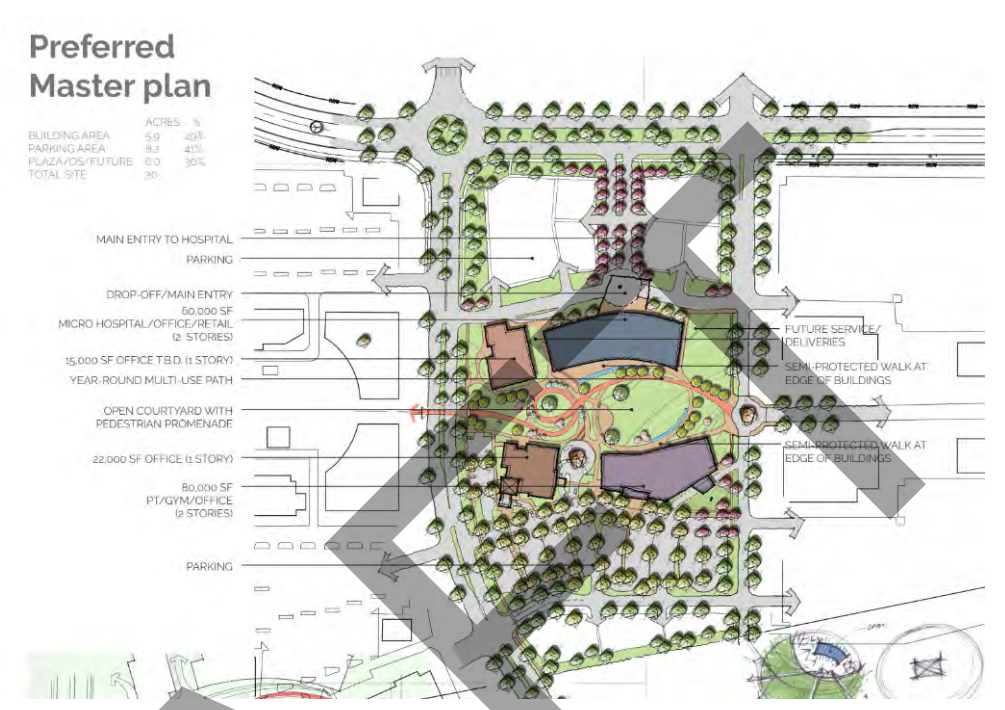
Preferred Manster Plan