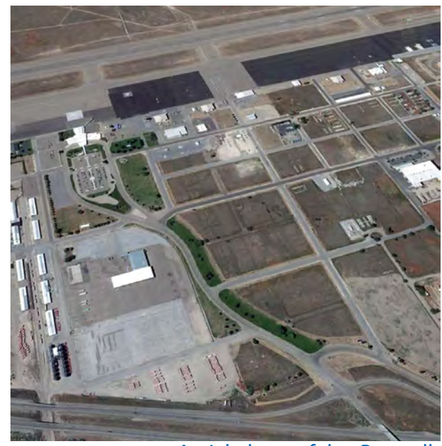
Aerial photo of the Pocatello Regional Airport

Continuing efforts are moving forward with the creation of two different Master Plans for the Pocatello Regional Airport. The first one is being initiated by the airport and relates to the airport facility itself. The second plan has been initiated by Bannock Development Corporation and encompasses the property around the airport that is owned by the City of Pocatello. This plan incorporates property located within the Airport District, and will help to direct the future growth and development of this area. Additionally, the PDA is working with the City of Pocatello to finalize a right-of-way plat for a road network to provide clarity for future investors of what land is available for development.