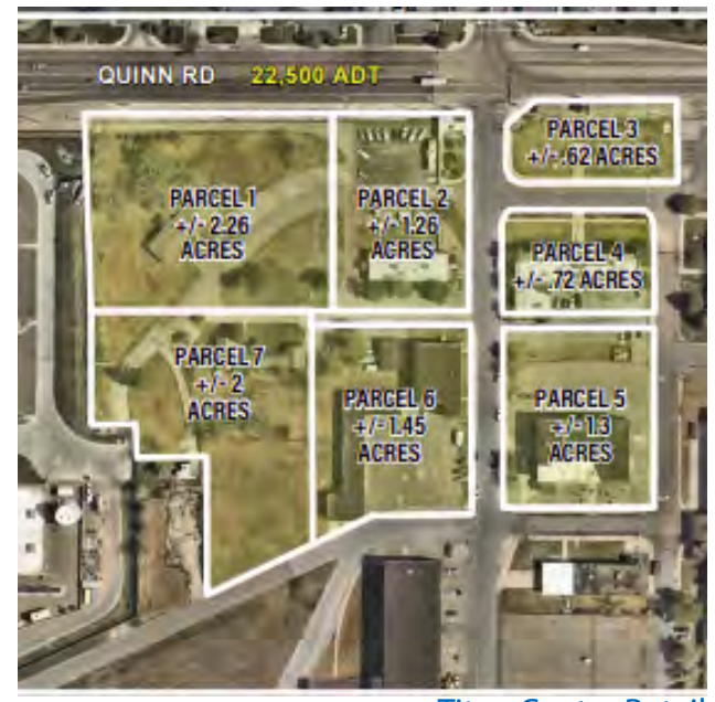
Titan Center Retail Commercial Center

Most recently the improvements to the facades of the buildings in the Naval Ordnance Plant were completed per the plans. IRG has invested great energy into rebranding the facility into the Titan Center and is looking forward to future potential opportunities to partner with the PDA. IRG is also planning the installation of a large mural on the tower building's east side. Additionally, IRG is actively pursuing new tenants and is looking to developing a new commercial center along Quinn Road on the northern end of the property.